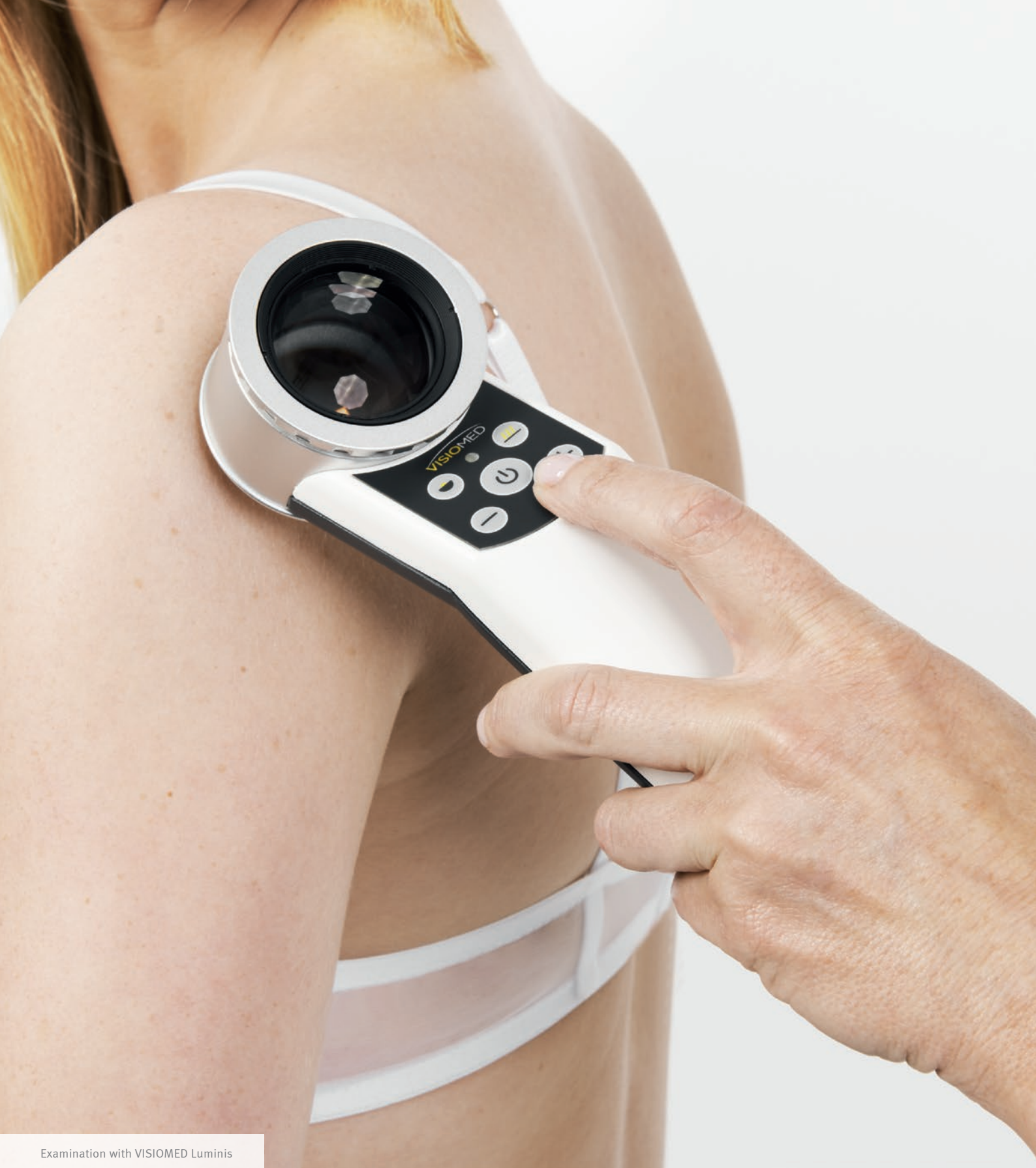
Examination with VISIONED Luminis