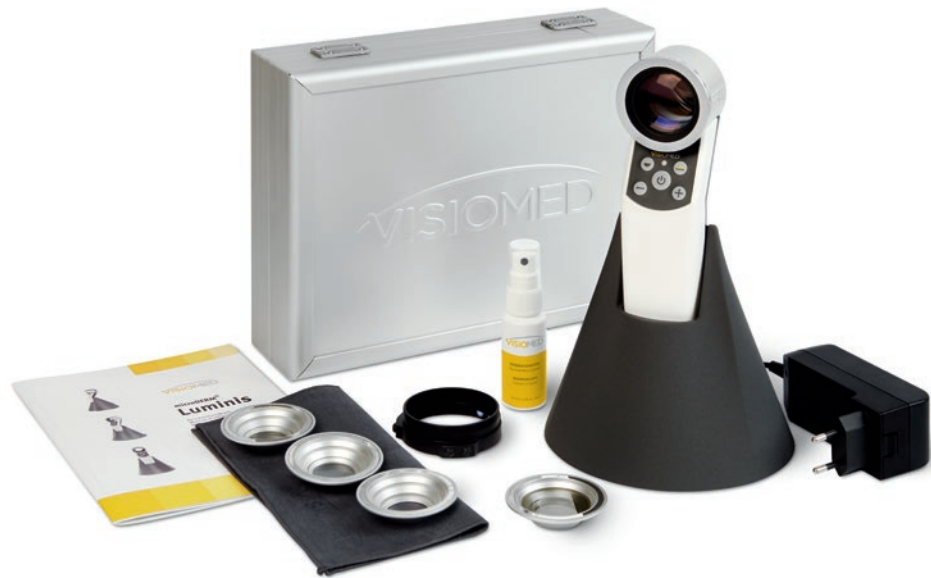
VISIOMED Luminis Premium Bundle. Scope of delivery and technical data are subject to change without prior notice.