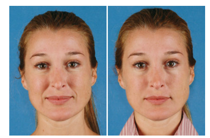
MatchPose Before & After